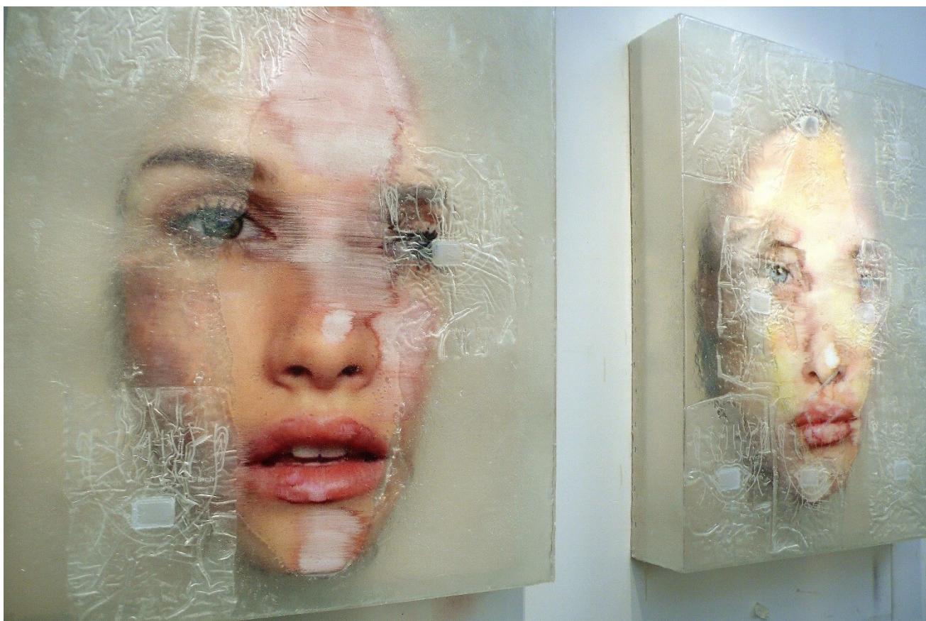
Her – under the surface, 2010, mixed media and resin

Press conference Thursday 15 March 4.30-6pm in the presence of the artist